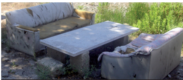
Outrageous scene: part of a Greek Orthodox grave from Eptakomi has been removed and used as a picnic table five miles away, at Nerou tou Philitou, Eptakomi. This desecration occurred between May 2008 and June 2009

Greek Cypriots who have visited their homes and lands in the occupied north are shocked and outraged at the wanton systematic destruction of the heritage of the uprooted Greek Cypriot inhabitants. While Turkey aspires to join the EU it is evident that it has nothing but contempt for the rich European culture and history of Cyprus