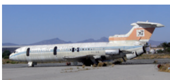
Abandoned Cyprus Airways aeroplane at Nicosia Airport, which is inaccessible due to the Turkish occupation

Greek Cypriots who have visited their homes and lands in the occupied north are shocked and outraged at the wanton systematic destruction of the heritage of the uprooted Greek Cypriot inhabitants. While Turkey aspires to join the EU it is evident that it has nothing but contempt for the rich European culture and history of Cyprus