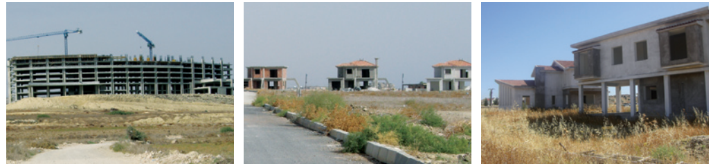
Stolen land: some of the illegal developments in occupied Cyprus where approximately 88 percent of land is owned by Greek Cypriots. Britons who purchased in the occupied north are at risk of losing their investments and their assets in the UK