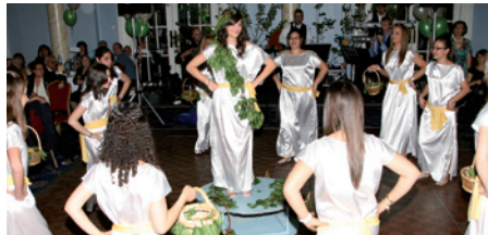
Top: Greek Cypriot youths raise the issue of the missing. Turkey has been found to be in breach of the European Convention of Human Rights for failing to investigate or disclose the fate of missing persons in Cyprus. Above: celebrating the rich culture and traditions of Ayios Amvrosios, currently under Turkish occupation. London, June 2009

be forgotten. It must also not be forgotten that the Cypriots who cannot return to their lands because of the presence of illegal Turkish troops want their properties back not only because they want the "bricks and mortar" so they can pass it on to their children but also because it is their heritage and birthright.