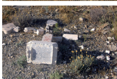
Above: graves at Flamoudi, near Kantara are looted and destroyed, left strewn across the ground as if mere rubbish